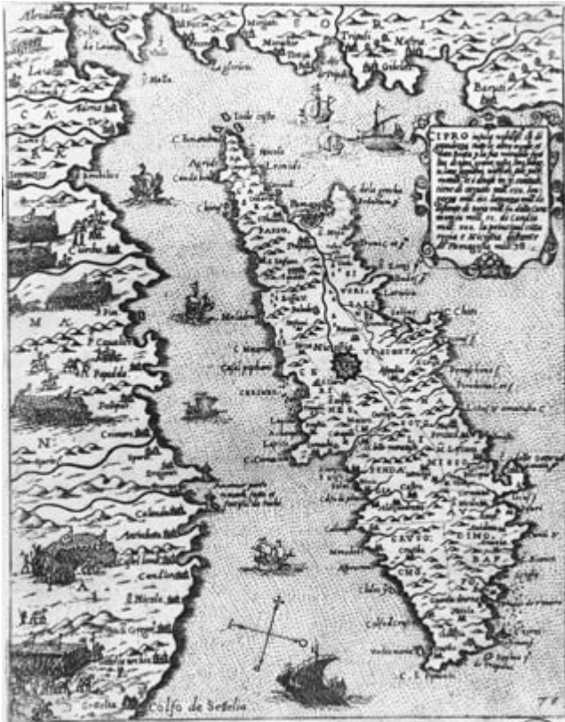
FIG. 8.4. MAP OF CYPRUS FROM GIOVANNI FRANCESCO CAMOCIO'S ISOLARIO , CA. 1570–74. The map depicts the massive military preparations of the Ottomans on the shores of Asia Minor before their onslaught to capture the island in July 1570. This composite edition is one of the many isolarii published during the last decades of the sixteenth century. These works illustrated the armed conflicts arising from the spread of the Ottoman Empire. Although Camocio had only just published a more accurate map of Cyprus in 1566, he preferred in his topical isolario to copy the map of the island by Paolo Forlani (Venice, 1570), which showed the island divided into its eleven medieval districts. The only accompanying text is a brief legend on the map. Size of the original: 20 × 16 cm.

Between about 1565 and 1575 a number of small-format composite isolarii appeared, containing pictures of towns and fortresses as well as island maps. These popular publications incorporated material that had been previously published as loose leaves: they all had much in common and often borrowed material from each other, so it is not always easy to identify the unsigned copperplate engravings contained within. One such volume, entitled Isole famose, porti, fortezze, e terre marittime , undated and unsigned, is usually attributed to the printer and publisher Giovanni Francesco Camocio, the publisher of twelve of the eighty-eight numbered prints it contains, although the title page gives Donato Bertelli's bookshop as