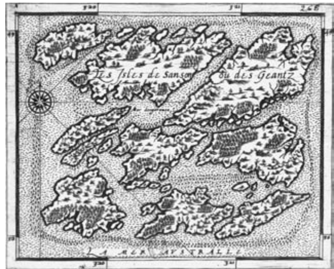
FIG. 8.6. MAP OF THE FALKLAND ISLANDS BY ANDRÉ THEVET (ACCORDING TO THE GEOGRAPHIC COORDINATES OF THE MAP). A typical example from Thevet's unfinished "Grand insulaire" (ca. 1586). The cosmographer calls the islands the "Isles de Sanson ou des Geantz"; conflating seafarers' tales with the biblical tradition, Thevet combined the natives of rather large stature seen by Magellan's fleet in neighboring Patagonia in 1519–20 with the giant hero of the Bible.

One of the works produced in the sixteenth century—the period that saw the most systematic development and widest dissemination of the isolario —is an extreme and utopian example of the genre. It is the unfinished "Grand insulaire" compiled by the French cosmographer André Thevet. 65 The new isolario was exceptional in its concep-