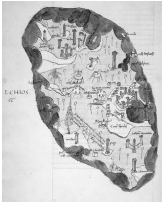
FIG. 8.1. MAP OF CHIOS ACCORDING TO THE “LIBER INSULARUM” OF CRISTOFORO BUONDELMONTI, CA. 1420. This work of Buondelmonti was the model for all subsequent isolarii . The map clearly reveals the author’s humanistic approach in the way it pinpoints and identifies the ancient localities, as well its tendency toward an analytical survey of the physical features, land uses, and human settlements of the island. The map is from a fifteenth-century copy. The copyist has faithfully followed the instructions in the text for the coloring. Size of the original: 29 × 22 cm. Photograph courtesy of the Gennadius Library, American School of Classical Studies at Athens (MS. 71, fol. 31v).

grinations. It is worth mentioning that an irregular plan of arrangement is followed in several isolarii of the fifteenth and sixteenth centuries.