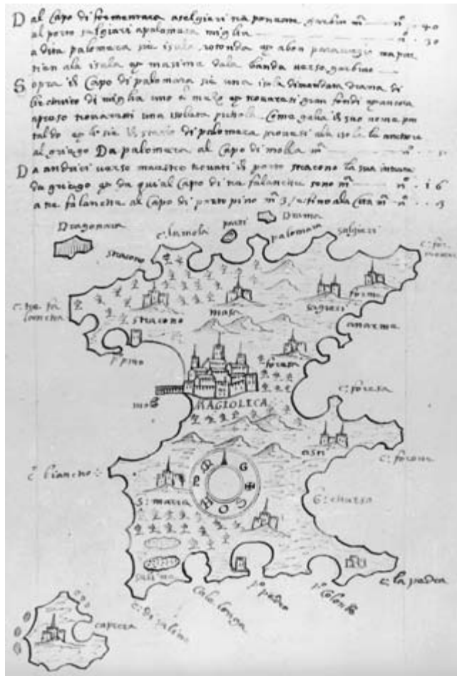
FIG. 8.5. MAP OF MALLORCA BY ANTONIO MILLO. A characteristic example of the vernacular and nautical isolarii that were current from the end of the sixteenth century onward. These isolarii were confined to the islands of the Mediterranean and were often accompanied by portolan texts or condensed sailing instructions ( arte de navigare ). These manuscript isolarii continued to be reproduced and used until the middle of the seventeenth century.

isolarii contained only pictorial matter, uninterrupted by any narrative. The only words on Pinargenti's and Bertelli's maps are the titles, but Camocio often added a brief note in the title cartouche giving the position and size of the region shown on the map and naming the sovereign power. Finally, there was a noticeable change in the style of the maps. Improvements had been made in the technique of copperplate engraving, and the publishers of these books were among the best engravers of the sixteenth century. Each island was now a self-contained, microscopic landscape framed by its cursorily drawn coastline and depicting wooded hills, valleys, rivers and roads,