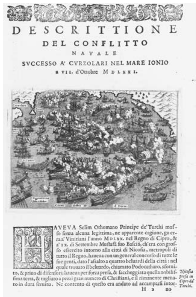
FIG. 8.3. DESCRIPTION AND ILLUSTRATION OF THE SEA BATTLE OF LEPANTO (7 OCTOBER 1571). From Tommaso Porcacchi, L'isole piu famose del mondo (Venice, 1576), map engraved by Girolamo Porro. The integration of topical material in the isolarii was a result of the gradual shift of the genre toward the field of information during the last decades of the sixteenth century.

Porcacchi's work also marks an important departure for isolarii . As an anthology of islands, L'isole ignores the structural unity of space: geography fragments as history and ethnography move to the fore. In this way Porcacchi opens the genre up for a new type of island book, a topical isolario that, in addition to depicting the island, also reports on the political situation prevailing in the area, with coverage almost exclusively confined to the coast-