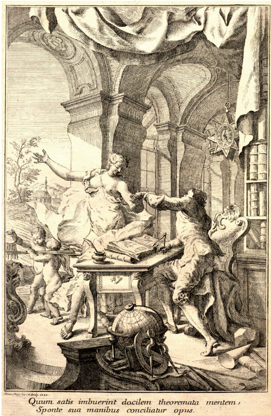
FIG. 2. FRONTISPIECE TO JOHANN JAKOB MARINONI, DE RE ICHNOGRAPHICA, CUJUS HODIERNIA PRAXIS EXPONITUR, ET PROPRIIS EXEMPLIS PLURIBUS ILLUSTRATUR (VIENNA: LEOPOLDUM KALIWODA, 1751). Designed and engraved by Franz Mayr in 1749.

Size of the original: 25.2 × 16.4 cm.